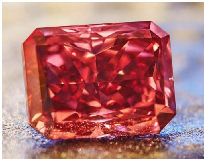
The 2.11-carat radiant-cut fancy red Argyle Everglow, the top lot of the 2017 Argyle Pink Diamonds Tender

According to Argyle Coins, over the past 15 years, the value of Argyle Pink Diamonds sold at Tender have appreciated by over 300%.