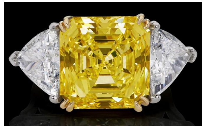
A Fancy Intense Yellow Diamond Ring

Colored diamonds are far rarer than colorless diamonds and colorless diamonds are already considered internationally to be highly valued assets. An indisputable truth about color diamonds is that regardless of color, all possess unique qualities that continue to grow in value, as they have done for more than 2 decades! Colored diamonds are found in