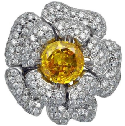
A 3 Carat Fancy Vivid Orangy Yellow Zimi Ring

When considering a color diamond as an investment, customers should choose extremely rare stones, no matter the color. Similar to any other investment commodity, supply and demand influence value. For example, a yellow diamond of the right intensity level, size, and characteristics can be considered a very wise and affordable investment! When compared to many of the world's most successful and valuable commodities and their appreciation over the past ten years, fancy vivid yellow diamonds have proven that they do not only rise in value over time, they far surpass other commodities such as stocks, bonds, gold and even oil. Fancy Vivid Yellow Diamonds have been sold over the past decade in various sizes and many have managed to bring over $100,000 per carat! This goes to show that it is not black and white when it comes to diamonds, and that each and every colored diamond needs to be assessed for the individual qualities that it possesses. No two are the same!