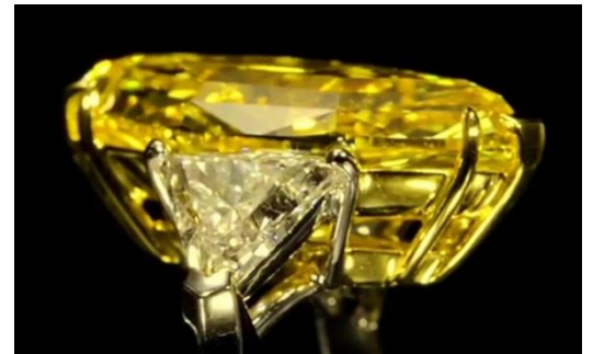
A rare and extraordinary 10 carat Fancy Vivid Yellow Zimi Marquise Shape Diamond

When choosing Zimi or other fancy diamonds, always work with a trusted specialist known for expertise in colored diamonds. There are few dealers like Premier Diamond fortunate enough to have relatively steady access to Zimi Yellow diamonds.