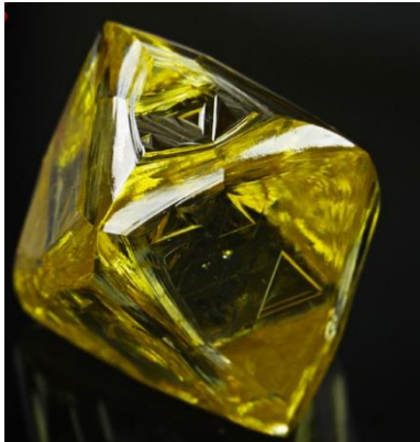
28 Carat Rough Vivid Yellow Zimi

While there are many regions where yellow diamonds can be found, Sierra Leone is recognized as the source of some of the most rare and strikingly beautiful yellow diamonds in the world. In fact, diamonds